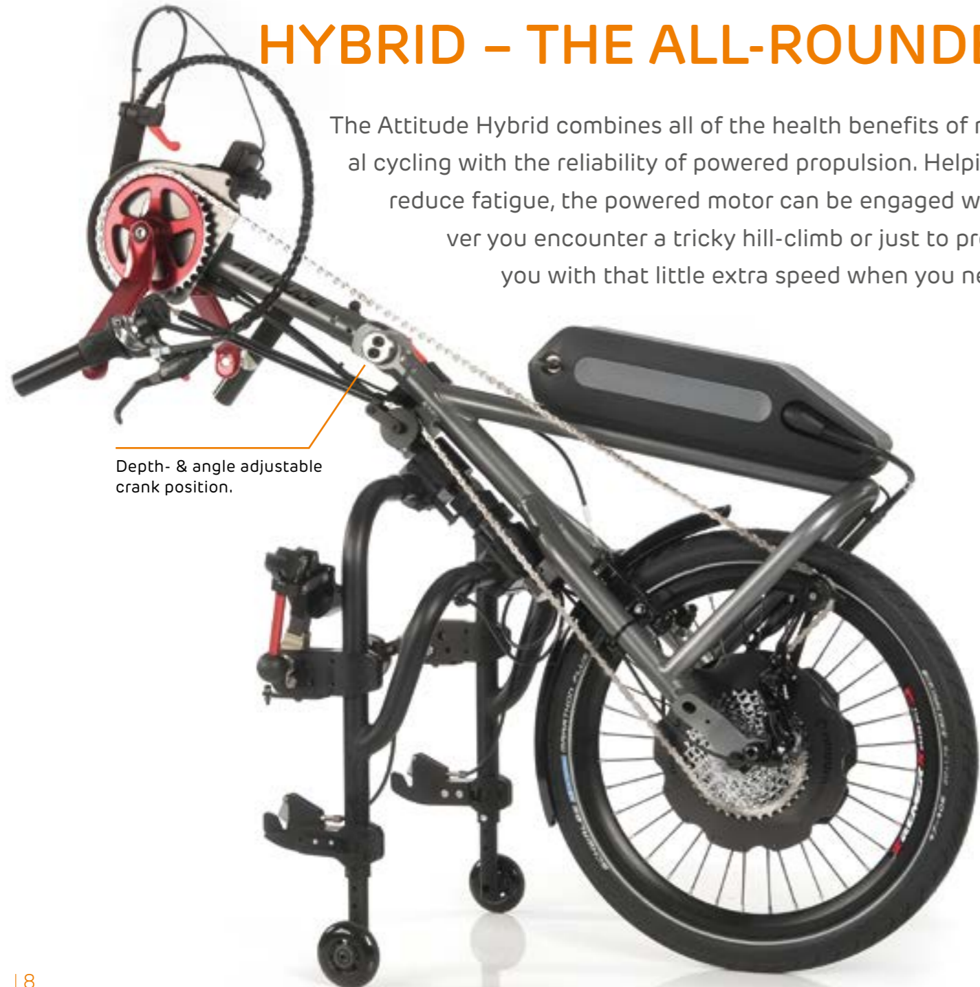
Depth- & angle adjustable crank position.

The Attitude Hybrid combines all of the health benefits of manual cycling with the reliability of powered propulsion. Helping to reduce fatigue, the powered motor can be engaged whenever you encounter a tricky hill-climb or just to provide you with that little extra speed when you need it.