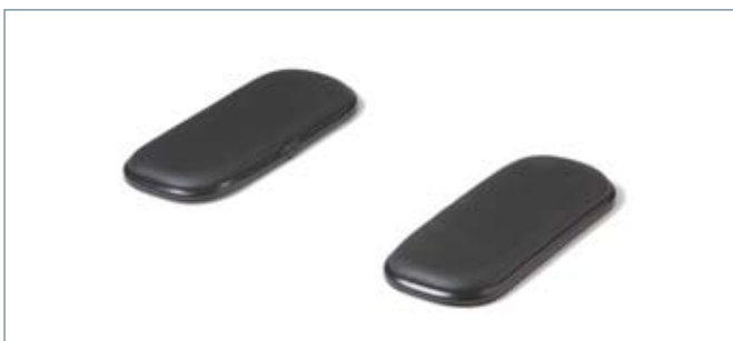
Armpads width: short - 25 cm