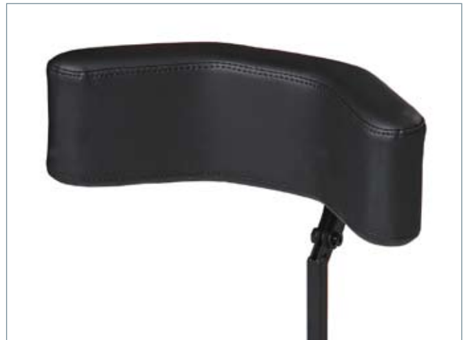
Comfort Wing headrest (flexible)