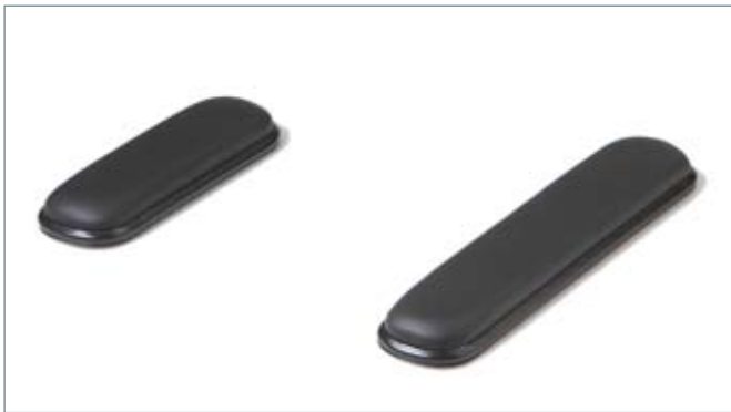
Armpads: short - 25 cm and long - 35 cm

Armpads are important to guarantee a good posture. They are therefore available in different types and sizes.