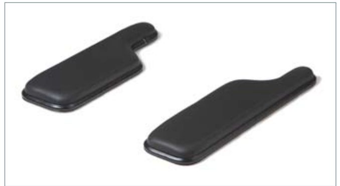
P-shaped armpads: short - 25 cm and long - 35 cm