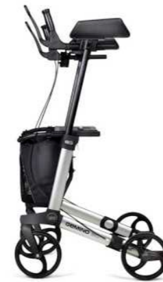
GEMINO 30 walker

Lightweight walker with adjustable forearm supports. The perfect companion if you need extra support and stability indoors. Also great for gait training.