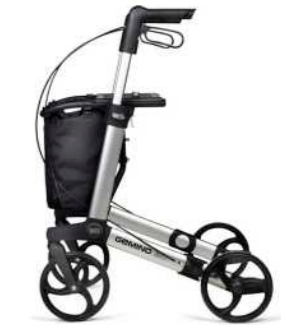
GEMINO 30 parkinson

In case of sudden acceleration, the SpeedControl wheels will automatically give resistance