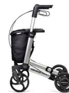
GEMINO 30 SpeedControl

For extra security the brakes in the rear wheels will automatically come into action in case of sudden acceleration. Great for gait training