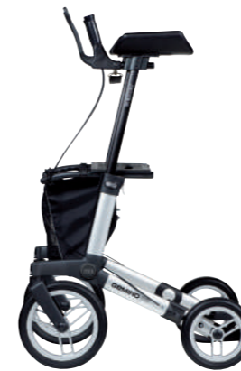
GEMINO 60 walker

Height-adjustable forearm supports for extra support and stability