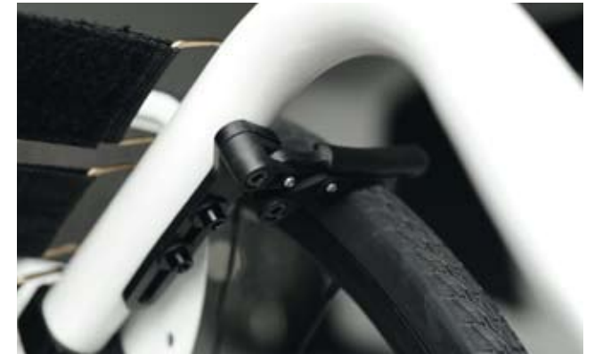
NEW lightweight compact wheel lock Improved design offers a lightweight, yet strong solution.