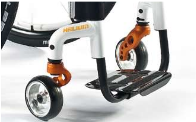
NEW carbon fibre footplate Lightweight and stylish footplate with angle and depth adjustment.