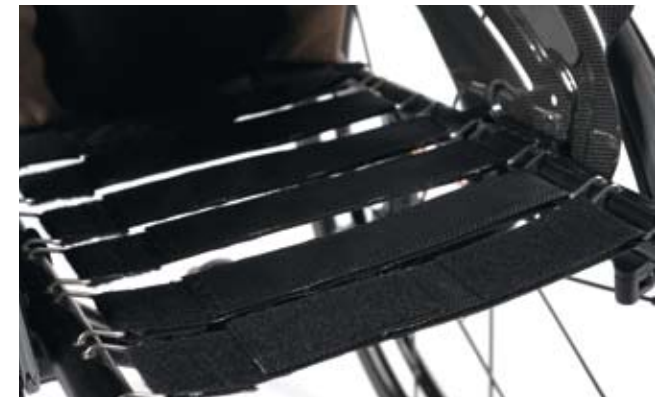
NEW clip style air flow seat upholstery Offers adjustable seating and increased rigidity for improved comfort and postural support.