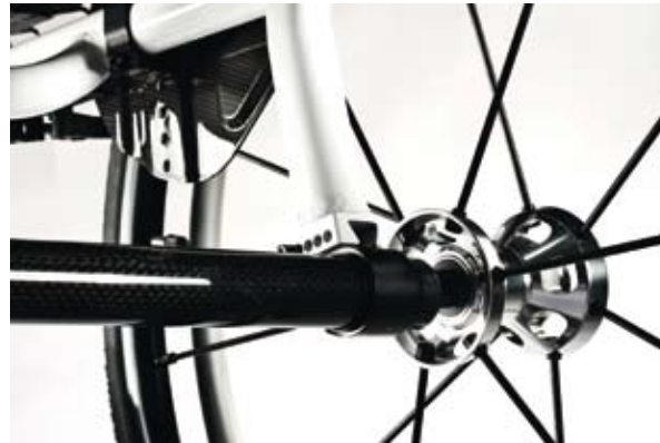
NEW carbon fibre axle tube Less weight, superb looks.