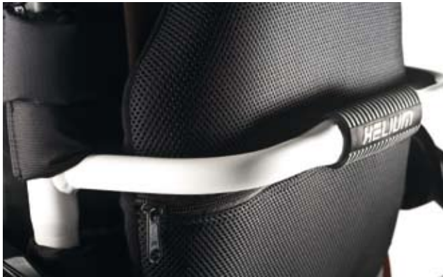
NEW oval shaped back tube with ergonomic hand grip. Increases rigidity by 15% and enables easier lifting and transfer. Available in two depths for improved positioning.

The latest technologies combined with innovative materials and stylish design - pure Helium