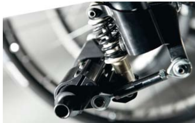
NEW suspension Sporty and lightweight suspension for a comfortable ride.